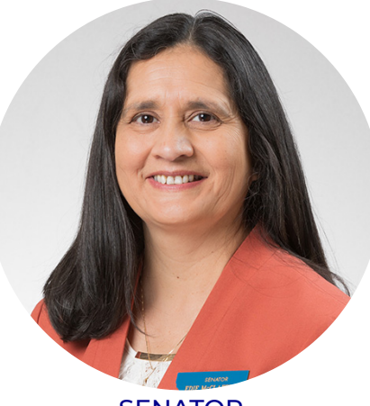
SENATOR EDIE MCCLAFFERTY (D)